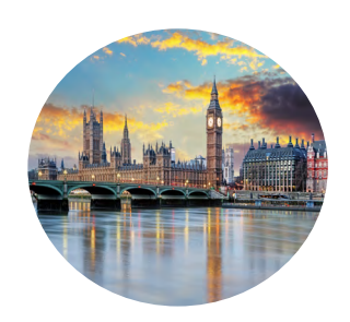
17 - 19 October 2024

Istanbul, Turkey C and TRADE O.2, Shipping is turning green Organising commission: Labour Law; Corporate and M&A