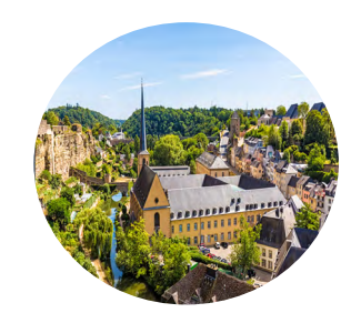
13 - 16 November 2024

Riyadh, Saudi Arabia Middle East Regional Meeting