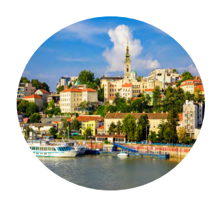
18 - 20 April 2024

Beyond banking: When restructuring hits the finance Organising commission: Banking, Finance & Capital Markets; Insolvency; International Arbitration