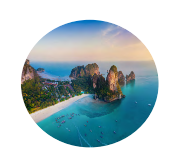
27 September 2024

Madrid, Spain 62nd International Young Lwayers' Congress Thinking Globally – The Role of International Lawyers in a World Searching for Answers