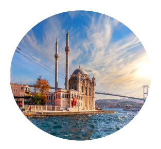
10 - 12 October 2024

Istanbul, Turkey C and TRADE O.2, Shipping is turning green Organising commission: Labour Law; Corporate and M&A