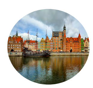
09 - 11 May 2024