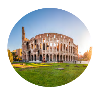
14 - 16 March 2024

Organising commissions: Real Estate; Tax Law