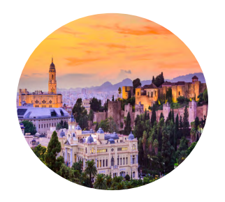
24 - 26 October 2024

London, United Kingdom Practical complex litigation Organising commission: Litigation; Real Estate