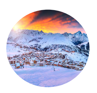
21 - 24 January 2024

Alpe d'Huez, France Corporate and M&A and Insolvency Winter Seminar Organising commissions: Corporate and M&A; Insolvency.