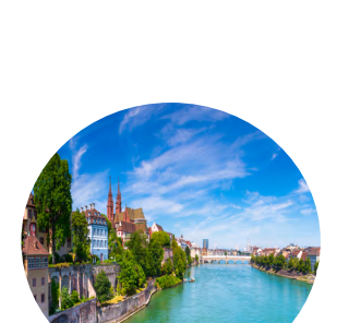
20 - 22 June 2024

Mexico City, Mexico Half-Year November Conference Law in the Times of the Digital Economy