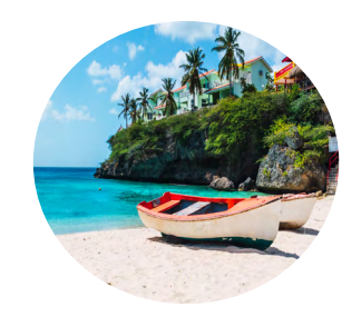
11 - 13 April 2024

Alpe d'Huez, France Corporate and M&A and Insolvency Winter Seminar Organising commissions: Corporate and M&A; Insolvency.