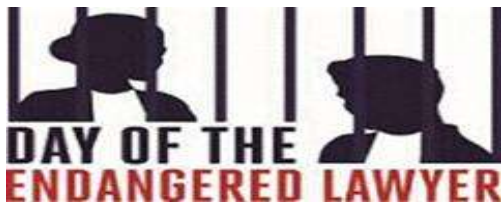
Foundation Day of the Endangered Lawyer