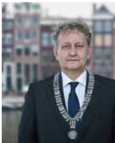
Mr E.E. (Eberhard) van der Laan, Mayor of the city of Amsterdam